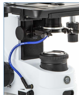
● Cardioid darkfield condenser with 5 W LED and integrated power supply

The unique iCare Sensor is developed to avoid unnecessary loss of energy. The illumination of the microscope automatically switches off approx. 15 minutes after microscopists step away from their position