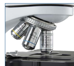
● S100x oil objective with built-in iris diaphragm