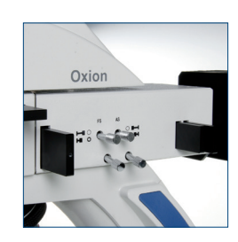
Detail of reflected illumination